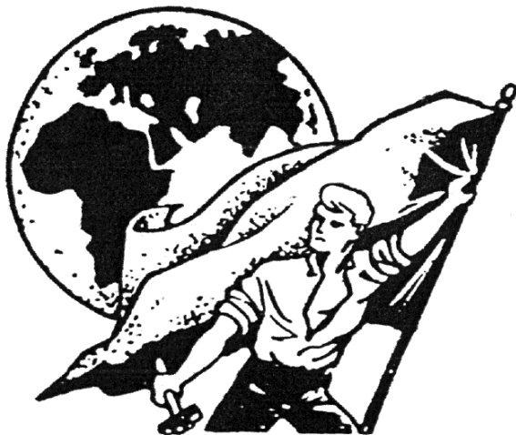
Emblem of the International Workers Association The Anarcho-Syndicalist International

Maximoff was an Anarchist revolutionary who was in Russia during the 1917 Russian Revolution and the subsequent Bolshevik counter-revolution. Like Emma Goldman, Alexander Berkman, Nestor Makhno and others, he witnessed first-hand the successes of worker control through the “Soviets” (workers committees), the spontaneous expropriation of factories and land by workers and their betrayal at the hands of the Bolsheviks. His vision of Anarcho-Syndicalism as a practical paradigm for a future society reflects this experience. Maximoff was an ardent opponent and critic of Bolshevism in books like Bolshevism: Promises and Reality and The Guillotine at Work where he describes how the Bolsheviks copied the slogans of the Russian Anarchists in order to gain political power for themselves, then betrayed and murdered the workers in order to cement their dictatorship.